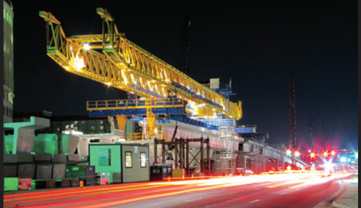
M.C. Dean (No. 14) is furnishing, installing, testing and commissioning the mechanical, electrical and plumbing systems on the Dulles Corridor Metrorail Project in Va., one of the biggest U.S. transportation projects.